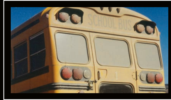
Common Dirt Road Problem