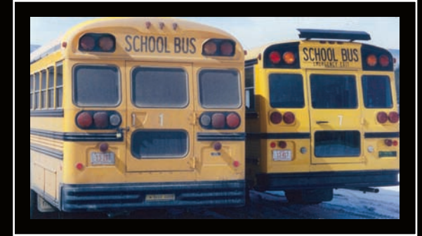
Comparison Under Road Dust Conditions – Cleaning Demands Significantly Eased