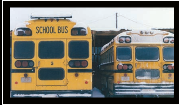
Resulting Clarity with the See II Foil

The SEE II Air Foil disrupts the vacuum draft created on the rear end as the bus parts the air. This results in improved fuel economy.