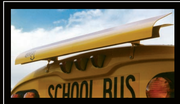
“New 5’ wide Aerodynamic Design”